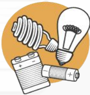
BATTERIES & BULBS