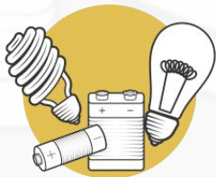
BATTERIES & BULBS